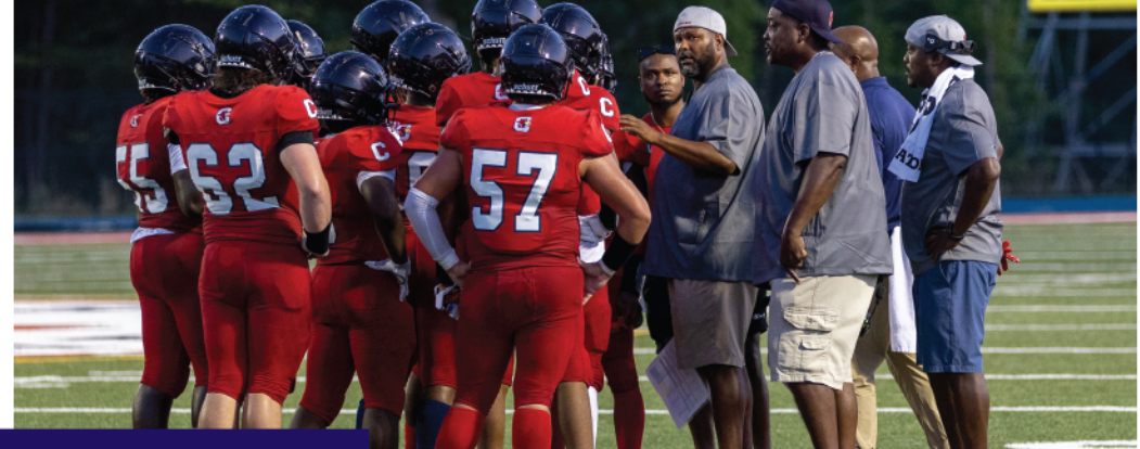
Varsity Football Team

Homecoming is right around the corner. We kicked off the celebration this week with a Spirit Week at the high school and will have a Powder Puff football game after school on Wednesday, September 27. We will also be hosting our high school Homecoming Dance, on September 30th, in our school gym. Tickets are on sale now and the link to purchase is located on Schoology. This is a fun time to show our school spirit and all are invited to the game on Friday, September 29th. Can't wait to see you there!